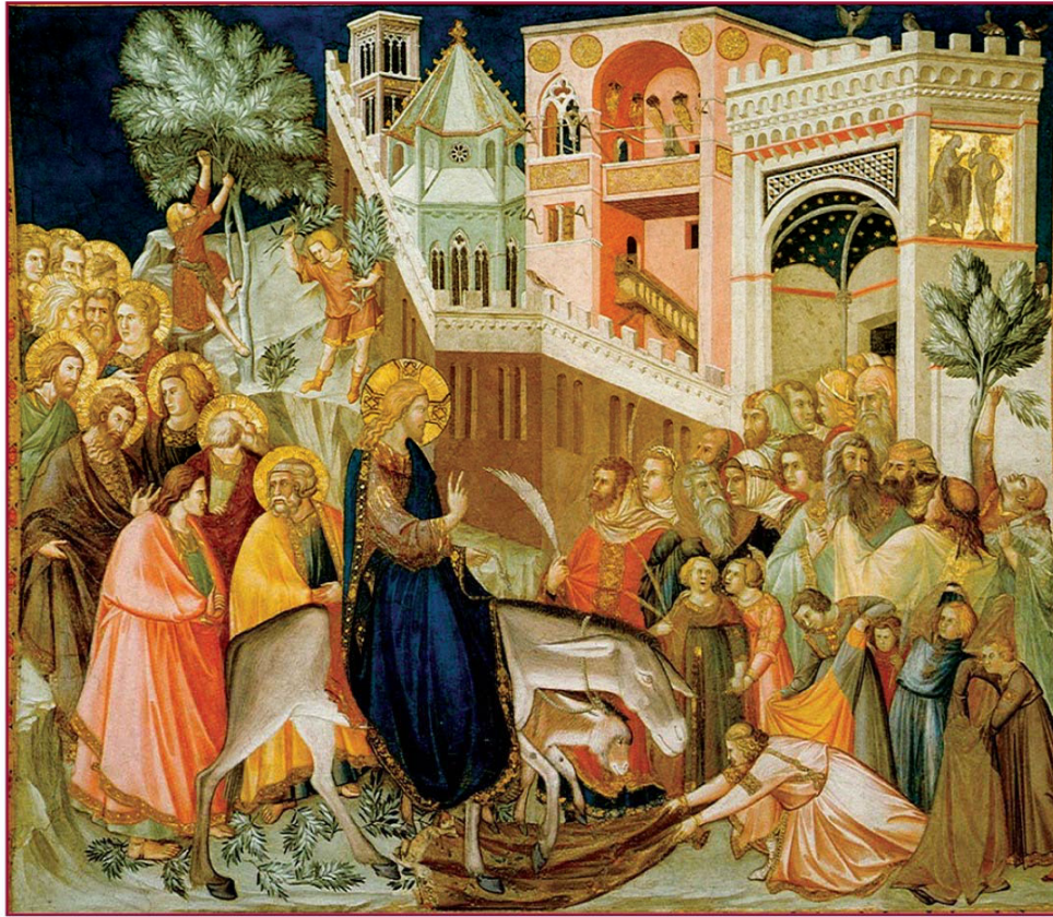
Pietro Lorenzetti, The Triumphal Entry, fresco ca. 1320