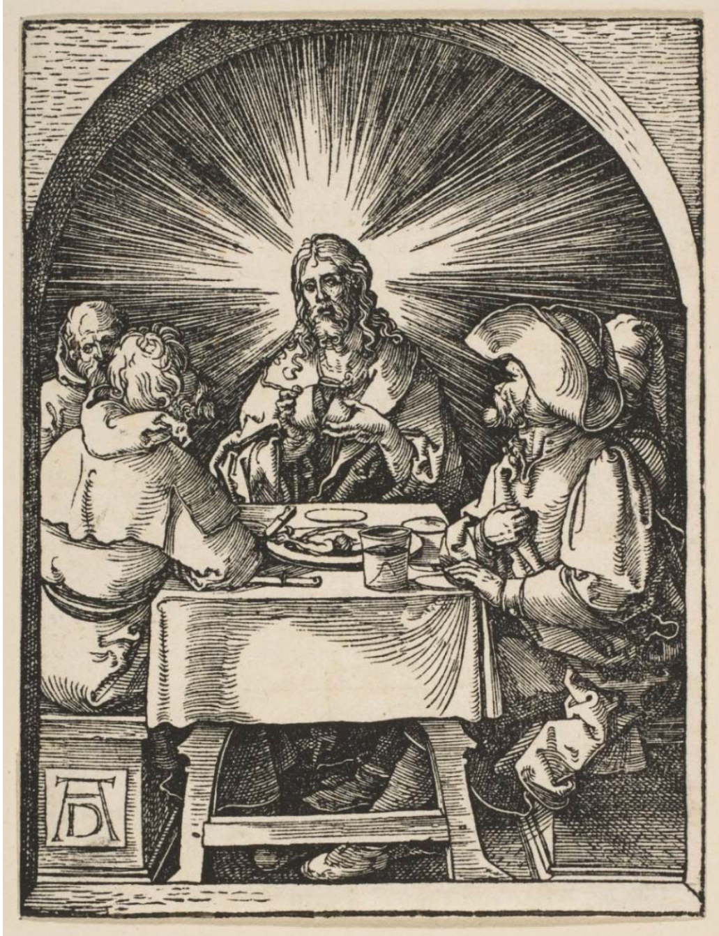
Albrecht Dürer, The Supper at Emmaus, Woodcut from the Small Passion, 1511